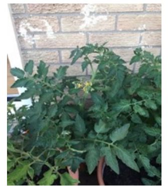
Full image (above) and focused image (below)