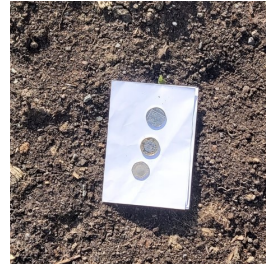
Examples of size references (above) and image capture (below)